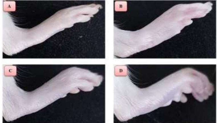
Fig 5 Macroscopic images of carrageenan-induced hind paw oedema and the effects of ME (400 mg/kg) and indomethacin (10 mg/kg). (A) Normal; (B) control; (C) ME (400 mg/kg); (D) Indomethacin (10 mg/kgb.w.)

The aim of research is to find out new herbal origins from plants, which are potent and non toxic agents. These plants are traditional medicinal plants. Generally herbal drugs are free from side effects /adverse effects and are low cost medicines which will be beneficial for the people of our country. The improvement in quantity control and standardization of herbal drugs and their products have led to the development of effective quality medicines from