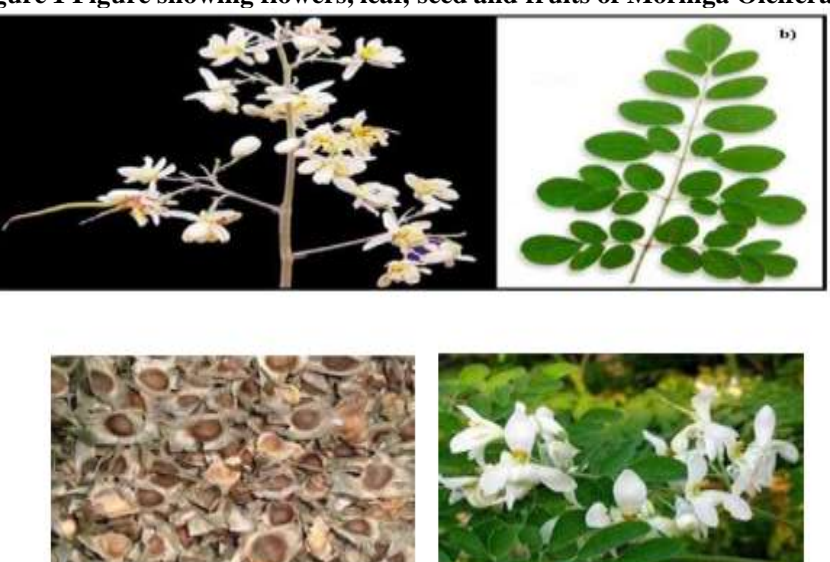
Figure 1 Figure showing flowers, leaf, seed and fruits of Moringa Oleifera

They turn brown on maturity, and split open longitudinally along the three angles, releasing the dark brown, trigonous seeds. Seeds measure about 1-1.2 cm in diameter, with three whitish papery wings on the angles. Seed weights differ among varieties, ranging from 3,000 to 9,000 seeds per kilogram.